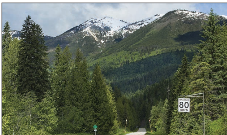
The photo shows gates that close Highway 31A between Three Forks and Retallack when the Highways department bombs the avalanche tracks on London Ridge. Taken near Retallack, looking into the proposed Zinton resort Crown land tenure.

AVALANCHES: As an added note of caution, there are three large avalanches that come down to Highway 31A from the proposed Crown land tenure area. There has been at least one death of a passing motorist. Every year the Ministry of Highways closes the road temporarily and bombs them from the air. But suppose skiers set them off before Highways can get there? Worse, in 2009 the road between New Denver and Kaslo was closed for several days due to a freak snowstorm that brought down avalanches on the highway at locations where no one could remember ever seeing them before — chiefly from