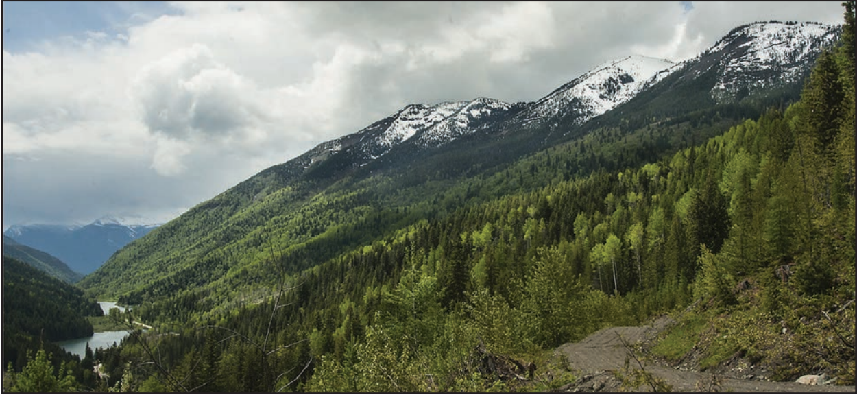
Fish and Bear Lakes. The Zincton proposal covers almost all of the area to the right of the lakes and goes over the summit and down to Kane Creek on the other side.